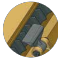
counterknives inside the casing gives a perfect result while mulching